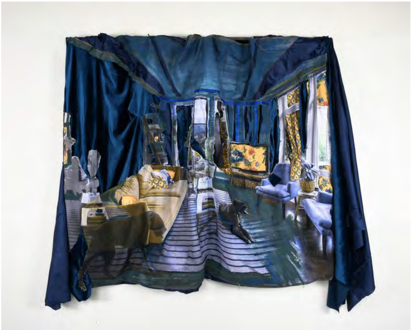
"Echo," a mixed-media tapestry by Alexis Day.

Though 2019 has been a bit of a slog, shows that open 2020 give the new decade a fresh start. A common thread in the exhibitions opening the new year is, of all things, beauty. Cerebral work around science and the environment at Upfor Gallery fits into this category, as does a show of quietly exuberant landscape painting opening in March at PDX Contemporary Art. Under the direction of a new curator, the Portland Japanese Garden will offer a year of thoughtful programming focused on peace to commemorate the end of World War II. And across the city, artists working in widely divergent mediums and subjects bring new ways of looking at the world.